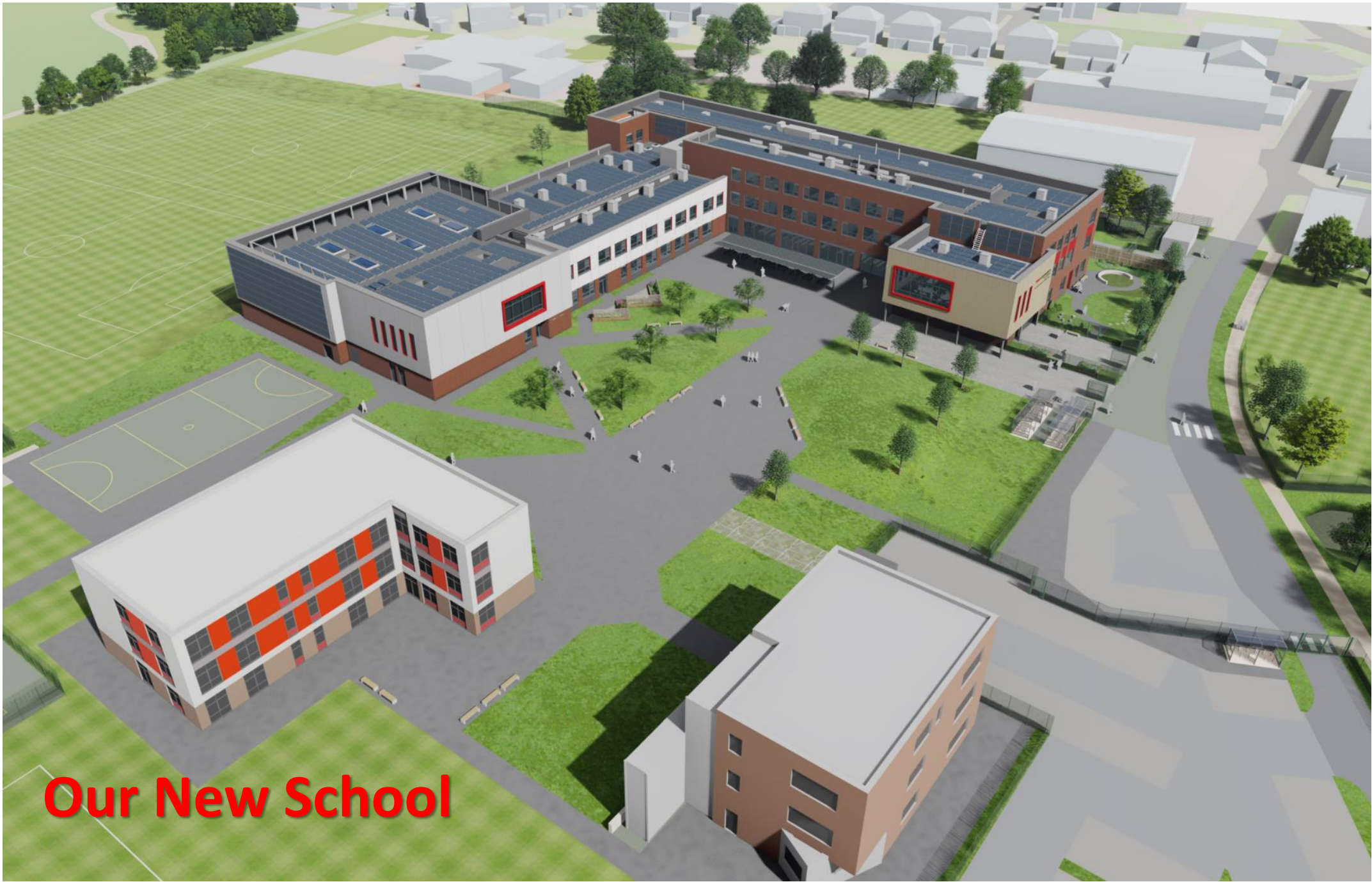
Our New School